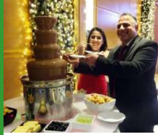
Chocolate Fountain With a selection of GF dips

Whether you're serving a fully gluten free event or simply want to make sure all of your guests are catered for, we have plenty of options that are fun and delicious! If there's something you would like that's not listed get in touch and we will source it for you.