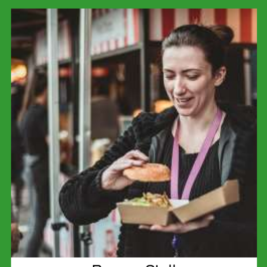
Burger Stall Flame grilled burgers served in a GF bun. Comes with a selection of toppings and sauces.