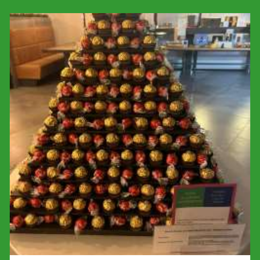
Lindt Chcoloate Tower A gluten free alternative to the Ferrero Rocher tower—a pyramid of chocolate truffles!

Hot Chocolate Creamy hot chocolate served with squirty cream and toppings, with the option of adding biscuits.