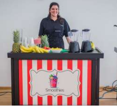
Smoothie Bar A selection of flavours available