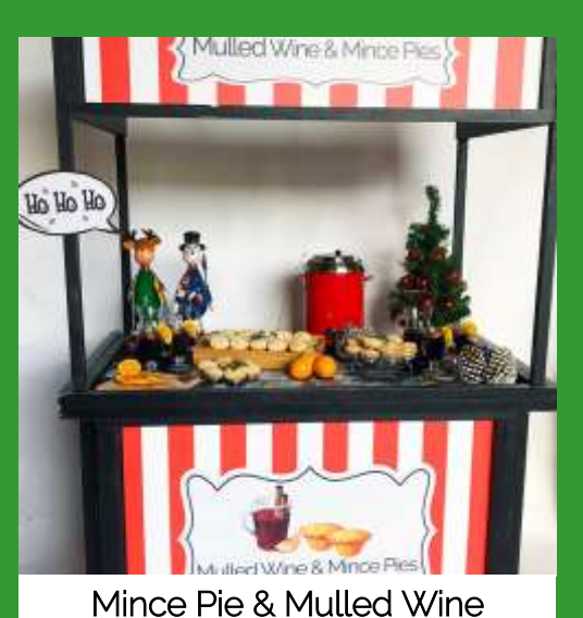
Warm, mulled wine served with a hot and fresh GF mince pie. A delicious festive treat.

Frozen Yoghurt Naturally fat free frozen yoghurt with a selection of toppings and sauces.