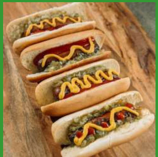
Hot Dogs Choose from our jumbo or standard size hot dog. Comes complete with onions and sauces.