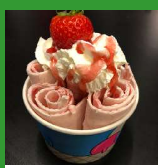
Ice Cream Rolls

Mix in your own flavours to create bespoke ice cream rolls, served with toppings and sauces.