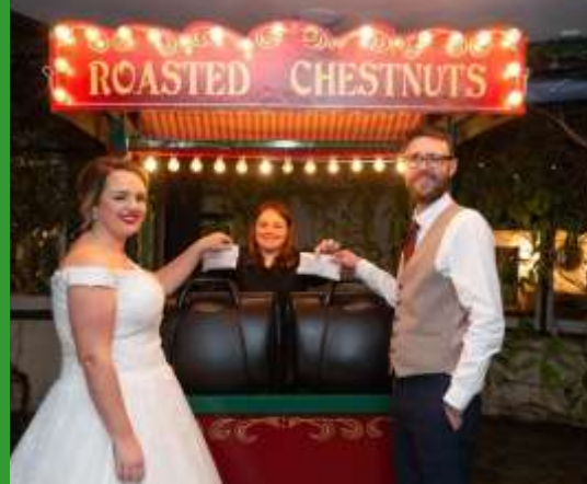
Roasted Chestnuts Served hot and fresh.