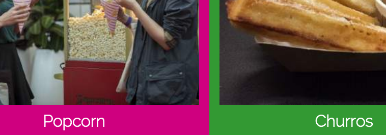
Hire Price From £322 + VAT