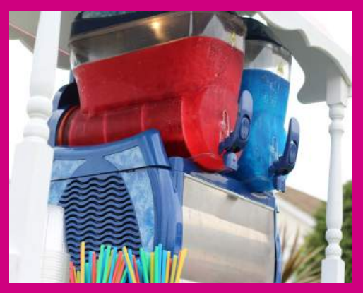
Slush Machine Hire Price From £155.50 + VAT

Every festival needs a supply of drinks to cater for every single person's taste! So with our mobile bar, you face no venue restrictions or fixed places, just the same premium brand wines, beers and spirits in the location of your choice.