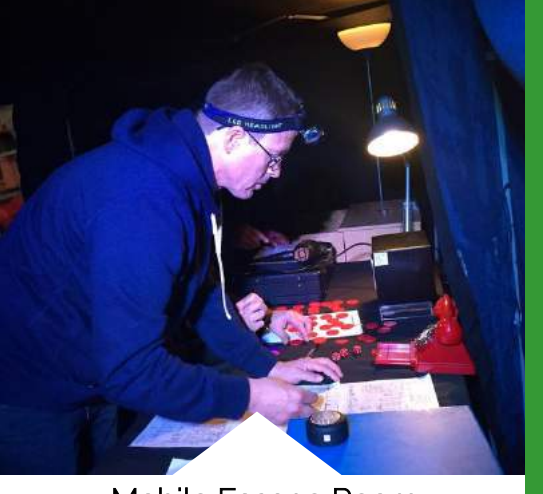
Mobile Escape Room

30 minutes to break out of the room and 2 game scenarios to choose from, who will you pick to help?