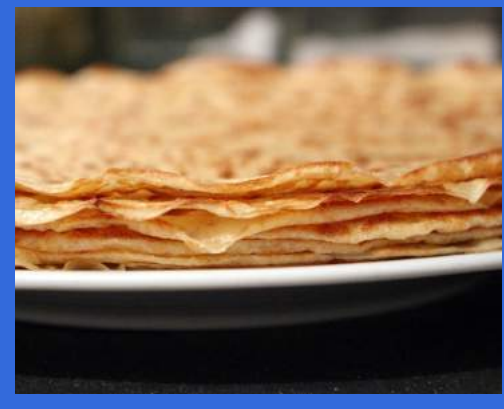
Crepes Hire Price on Application

The sweet aroma of freshly popped popcorn is difficult to keep anyone away, especially when it's made in front of you!