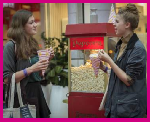
Popcorn Hire Price From £147 + VAT