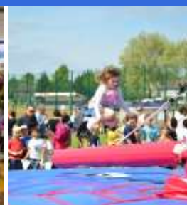
Last Man Standing