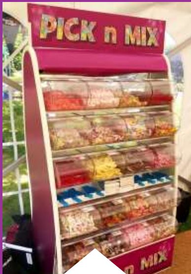
Pick & Mix Stand