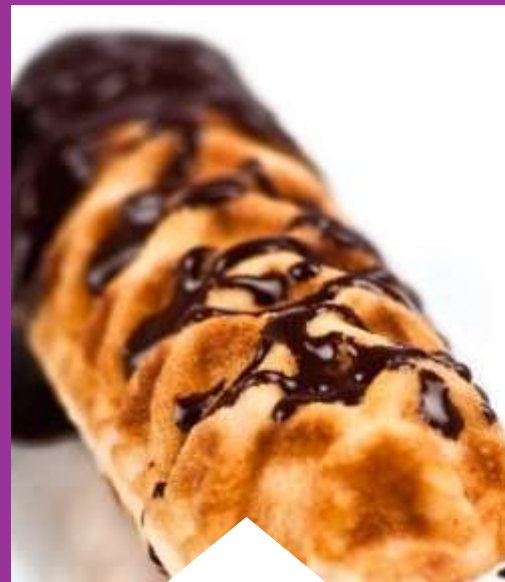
Waffles on Sticks