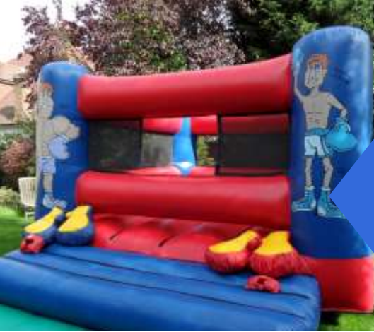
Bouncy Boxing Ring