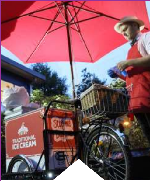
Ice Cream Trike