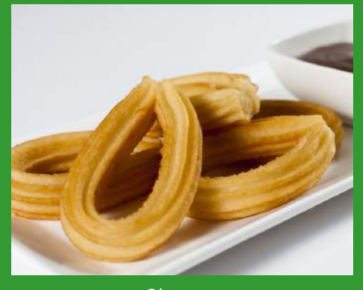
Churros Hire Price From £322 + VAT Branded Stand & Bags Available

The warming, sweet aroma of freshly made popcorn is difficult to keep anyone away!