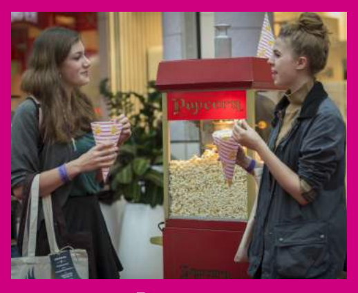
Popcorn Hire Price From £147 + VAT Branded Stand & Cones Available

The warming, sweet aroma of freshly made popcorn is difficult to keep anyone away!