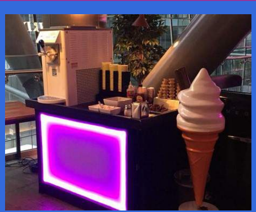
Ice Cream - Mr Whippy Hire Price From £227 + VAT Branded Stand & Tubs Available

Hire Price From £265 + VAT Branded Stand & Bags Available